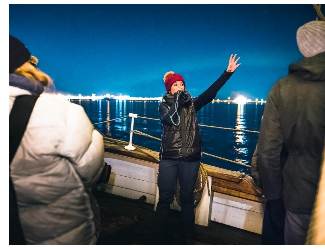
Northsail's guide www.northsailing.is

Offer a complete package with knowledgeable guides, refreshments, appropriate attire, and other essentials for a comfortable journey