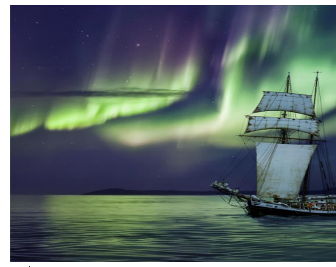
Ópal, Northsailing electrical sailboat and the majestic northern lights <a href="https://www.northsailing.is">www.northsailing.is</a>