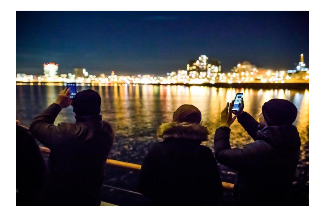
Reykjavík seen from Ópal, Northsail's sailboat www.northsailing.is

If applicable, secure access to iconic landmarks like Yoko Ono's Imagine Peace Tower for select dates.