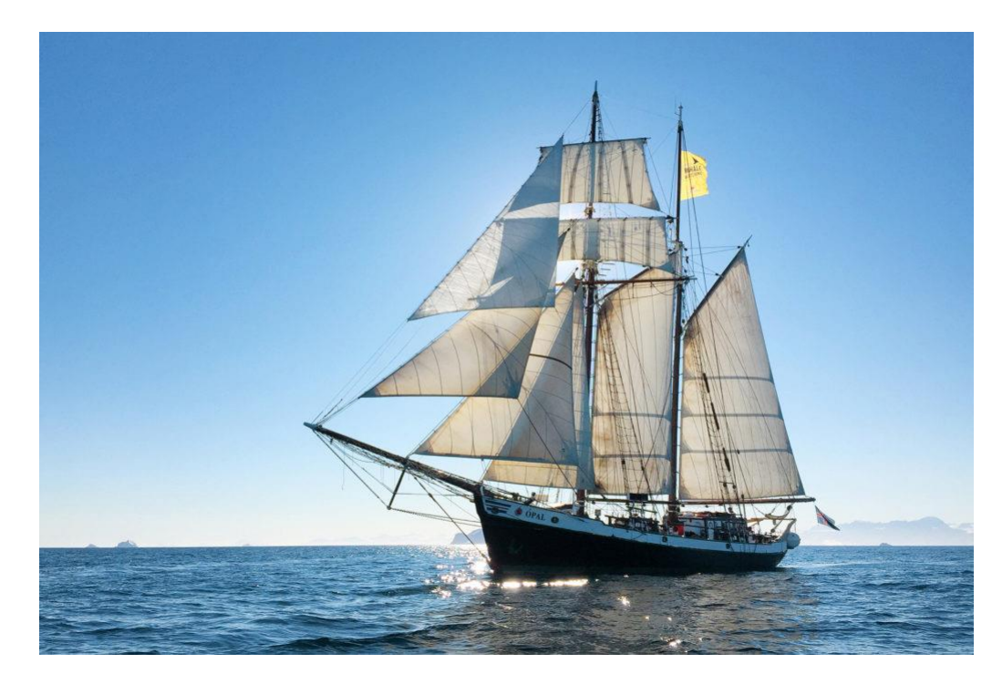
Schooner Opal -The silent electric sailboat www.northsailing.is

Train staff and guides to educate participants about the eco-friendly features and the importance of responsible tourism.