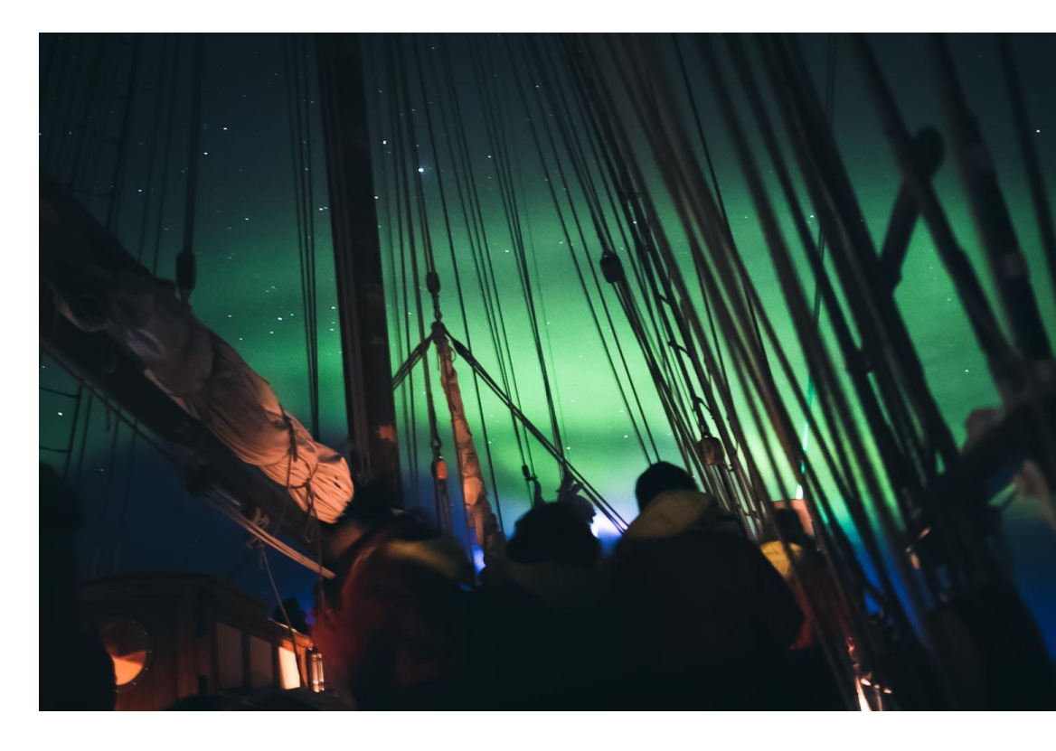
Tourists having a once-in-a-lifetime dark sky experience <a href="https://www.northsailing.is">www.northsailing.is</a>

Integrate cultural and historical narratives into the tour, sharing stories about islands, lighthouses, and local traditions.